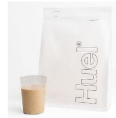
Huel® Essential 100g powder plus 500ml water 400kcal 20g powder