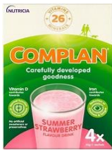
Complan® 1 sachet plus 200ml full-fat milk 338kcal 16g protein