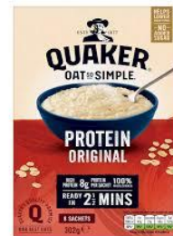
Quaker® Oat So Simple Protein Porridge 63g portion 240kcal 12g protein

For more ideas to boost your food intake please scan the QR code or follow the link to see Food-Based Resources .