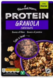
ALDI® Harvest Morn Protein Granola 45g serving 210kcal 8g protein