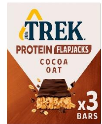
Trek® Protein Flapjack 50g bar 230kcal 9g protein