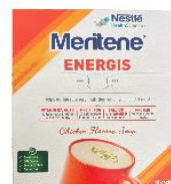
Meritene® Energis Chicken Soup 1 sachet plus 150ml water 207kcal 7g protein