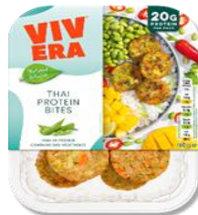
Viverra® Protein Bites Half a pack 188kcal 10g protein