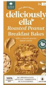
Deliciously Ella® Peanut Breakfast Bakes 50g bake 220kcal 6g protein