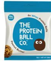
The Protein Ball Co.® High Energy Protein Balls 45g ball 190kcal 10g protein