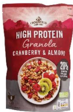
LIDL® Crownfield High Protein Granola 45g serving 200kcal 11g protein