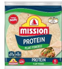
Mission® Protein Wraps 1 x 61g wrap 170kcal 10g protein