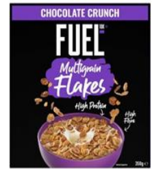
FUEL10K® High Protein Multigrain Flakes 50g serving 190kcal 14g protein