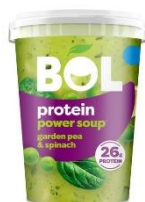
BOL® Protein Power Soup 300g serving 180kcal 13g protein