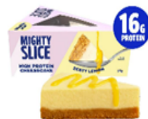
Mighty Slice® High Protein Cheesecake 115g slice 270kcal 16g protein