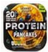
ALDI® Protein Pancakes 160g 380kcal 20g protein