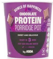
ASDA® Protein Porridge Pot 70g pot 280kcal 15g protein