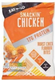
ALDI® Snackin' Chicken Bites 90g bag 170kcal 17g protein