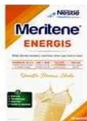
Meritene® Energis Shake 1 sachet plus 200ml full- fat milk 231kcal 16g protein