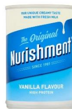
Nurishment® 400ml can 380kcal 20g protein