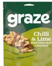
Graze® Protein Crunch 38g bag 230kcal 8g protein