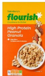
Sainsbury's® Flourish High Protein Peanut Granola 45g serving 200kcal 11g protein